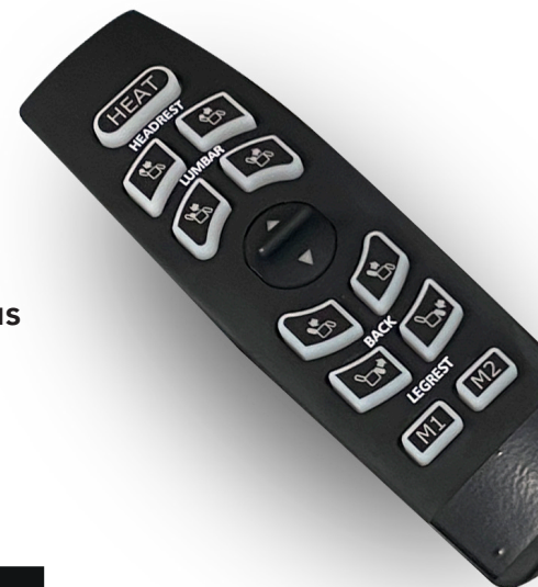
Premier Plus handset

This mechanism gives you everything you need from the Premier mechanism, and more! It has four individual motors that work independently within the headrest, backrest, leg rest and adjustable lumbar with an additional 2" footrest extension. However, the Premier Plus mechanism has some exciting additional features, such as simultaneous tilt in space movement, two programmable memorised positions, as well as built-in heat technology.